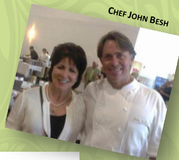
CHEF JOHN BESH