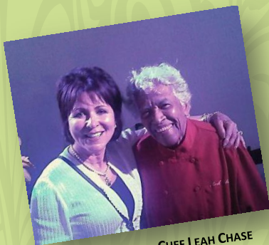
CHEF LEAH CHASE